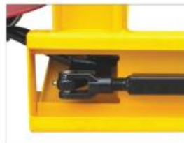
Adjustable straight tappet