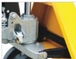
Adjustable pump cap