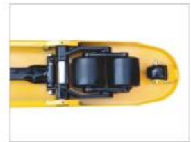
Entry roller for easy operation Innovative wheel frame