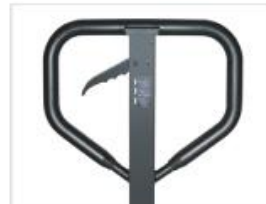
Option: fully rubber wrapped handle