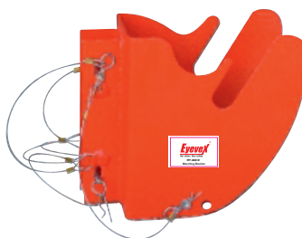
WITH SUITABLE BRACKET